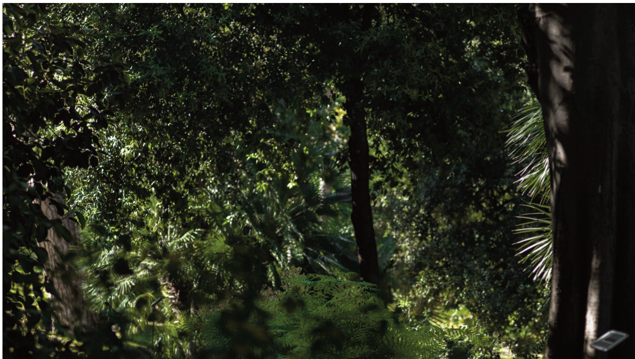
CAPTION MELIK OHANIAN Stuttering , 2014, Animated photographs. 69x122cm.